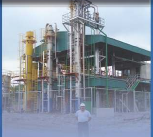
A FENIX-SHUTEK BIODIESEL PLANT RECENTLY COMMISSIONED